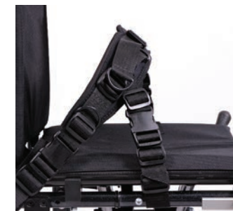
Neoflex belts Consult all possible solutions on our website www.vermeiren.com