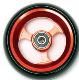
Aluminium red 3", 4", 5"