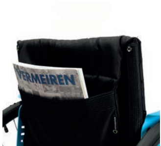
Pouch at the rear