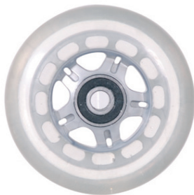
Transparent 3", 4", 5", 6"