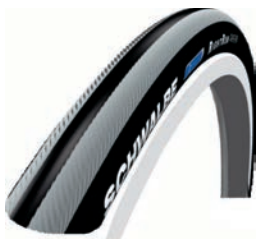
Right Run black tyres available with Design and Spirit wheels