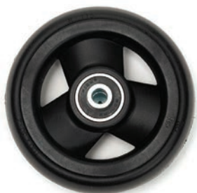
Standard black 3", 4", 5", 6"