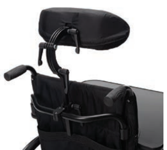
Multi-adjustable headrest B47