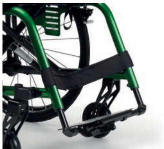
Monobloc, footplate in carbon, foldable