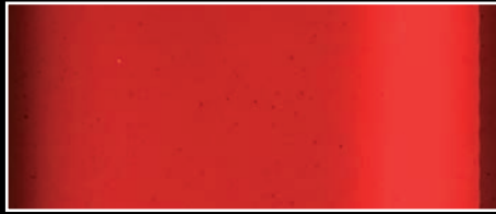
C4M - Bright Red Mat C4G - Bright Red Gloss