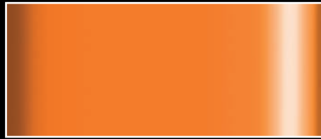
C53M - Orange Mat C53G - Orange Gloss