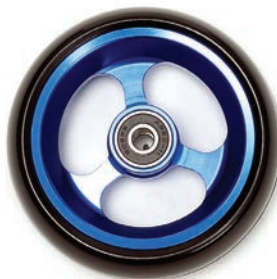
Aluminium blue 3", 4", 5"