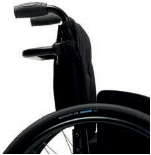
PH 01 Fixed push handles (12 cm) PH 02 Short, fixed push handles (8 cm)