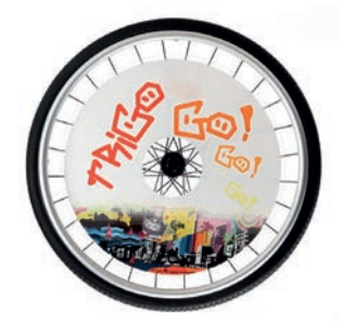
Spoke protectors Consult all possible models on our website www.vermeiren.com

More options and accessories to be found on our order forms.