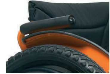
TUBE Armrests, retractable to the rear (only with fixed backrest)