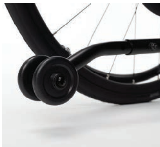
Anti-tipping wheel left or right B78L or B78R