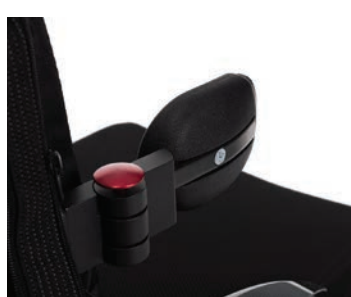
Side supports left or right (small size) L04S L or L04S R