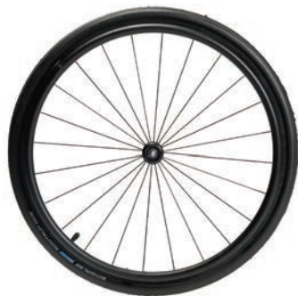
Design wielen 20", 22", 24", 26"