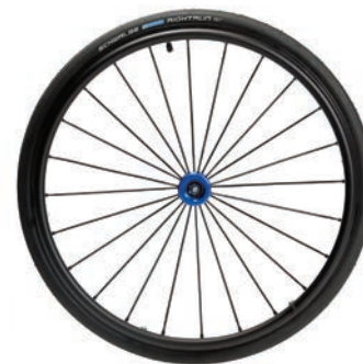
Spirit wheels blue 24"