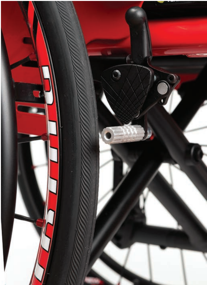
Push or pull brakes