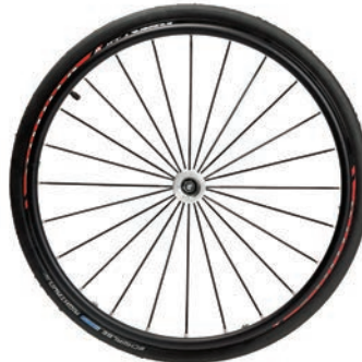
Spirit Wheels Aluminium 24"