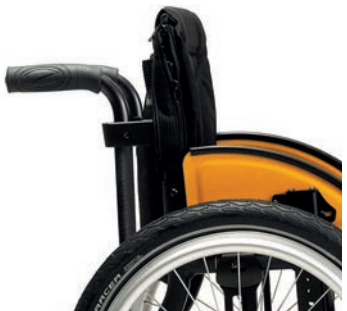
PH 06 Foldable and height-adjustable push handles (behind backrest tubes)