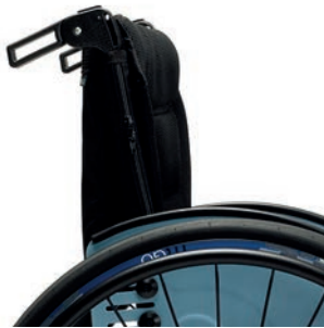
PH 05 Height-adjustable push handles (behind backrest tubes)