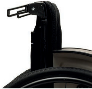
PH 03 Fixed, foldable push handles