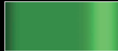
C73G - Metallic Bright Green