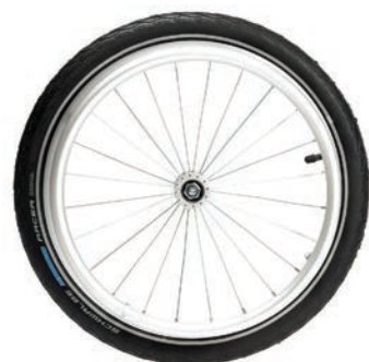
Standard wheels 18" 18"