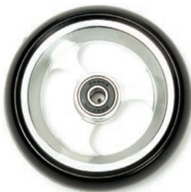
Aluminium silver 3", 4", 5"