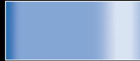
C56M - Blue Grey Mat C56G - Blue Grey Gloss