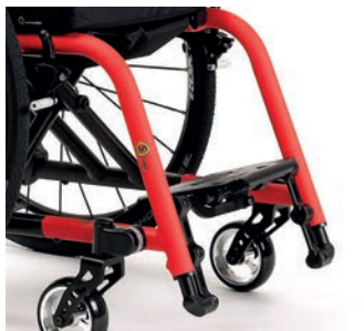
Monobloc, with higher footplate