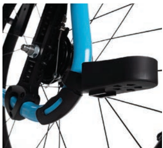
Crutch holder left or right B31L or B31R