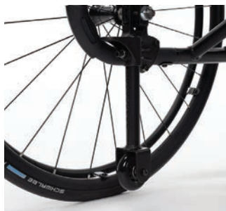
Travel wheels B86