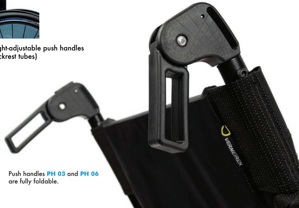
Push handles PH 03 and PH 06 are fully foldable.