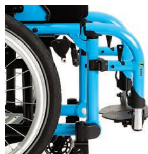
BA6 footrests, shortened by 5cm