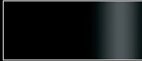
C5M - Black Mat C5G - Black Gloss