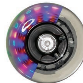
LED 4", 5"