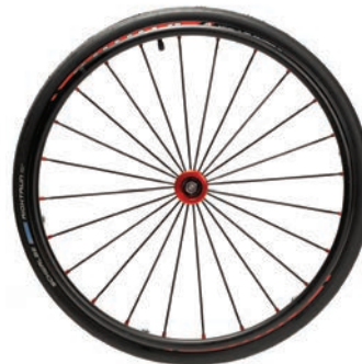
Spirit wheels red 24"