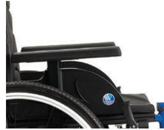
Bi5 Height-adjustable armrests