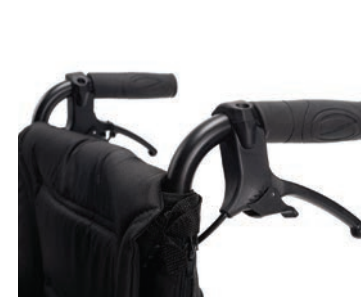
Drum brake grey wheels 24" x 1/3 8"