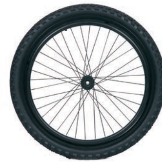
Off-road wheels 24"