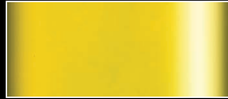
C8M - Yellow Mat C8G - Yellow Gloss