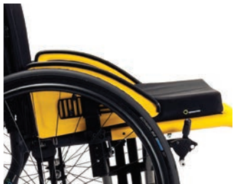
B82SL-A Long, removable armrest, aluminium