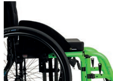
B82S-C Removable and adjustable clothing protectors, carbon