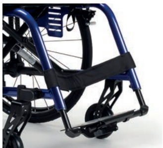
Monobloc, with retractable footplate