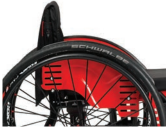
B82-S or B82-C FIXED Fixed, adjustable clothing protectors, aluminium or carbon