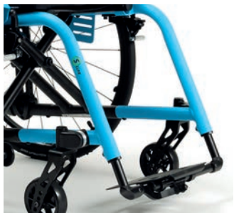
Monobloc, footplate in aluminium, foldable