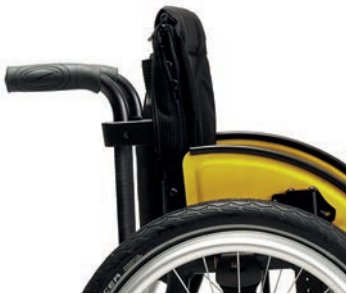
PH 04 Height-adjustable push handles (inside backrest tubes)