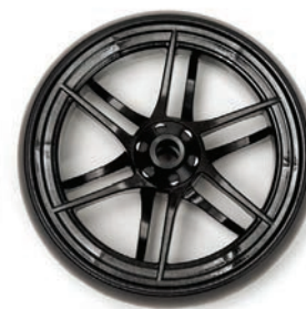
Carbon 4", 5"