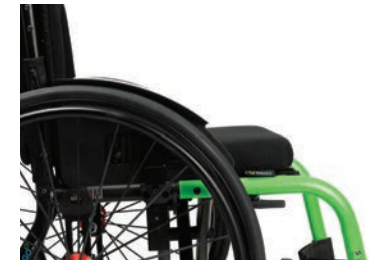
B82-C Long, removable and adjustable clothing protectors with mudguard, carbon