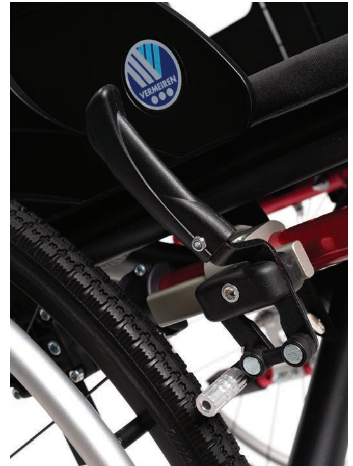
Traditional brakes with retractable handles (B40)