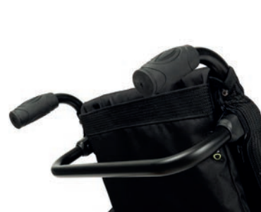
Stabilisation bar for backrest B90