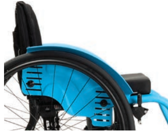
B82 FIXED Fixed, adjustable clothing protectors, aluminium with mudguard