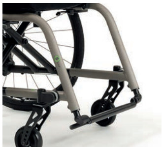
Monobloc tube in aluminium