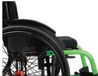
B82L-A Long, removable and adjustable clothing protectors with mudguard, aluminium