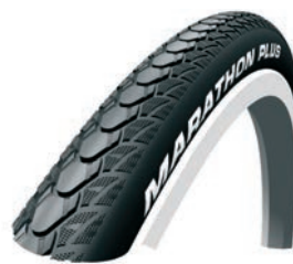
Marathon Plus tyres available with Design and Spirit wheels