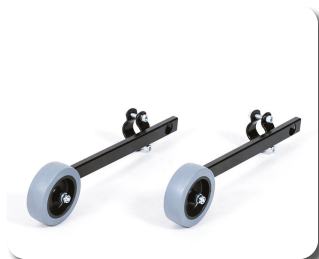
B86 - Travelwheels