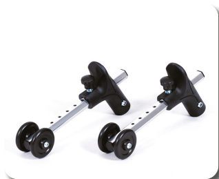
B78 - Anti-tipping wheels

Regarding quality, D200P complies with the highest norms, laid down by certified test institutes in most European countries.