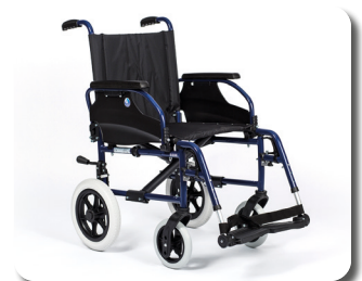
Transit model (T30)