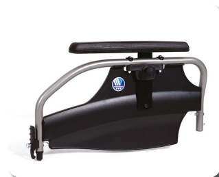
B05 - Adjustable armrest