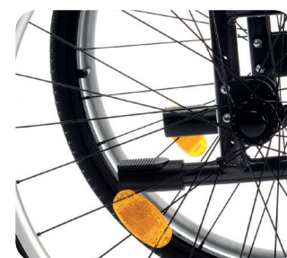
Two tipping pieces