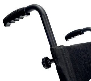
Height adjustable push handles