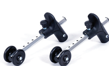
Option B78 - Anti-tipping wheels