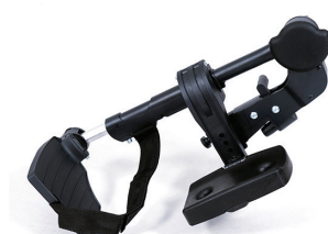
Option BZ8 - articulated legrest self-correcting in length