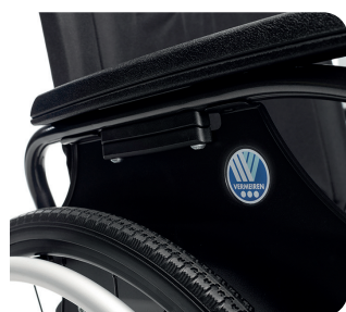
Armrests adjustable in height and depth to suit specific need