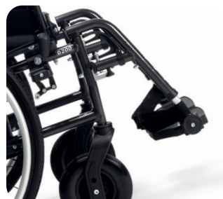
Removable swing-away leg rests (in and outwards)