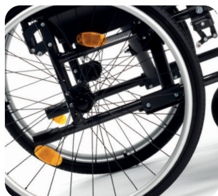
Rear wheels with quick-release system

All types of wheelchairs can be adapted, have numerous options and can be fully personalized so that there is a wheelchair for every person. This is the result of our continuous research and experience since 1957.