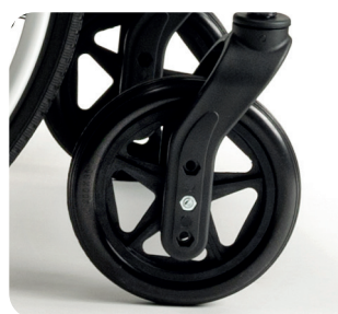
Adjustable front wheels