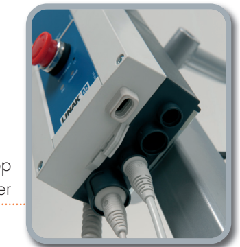
Control box with a red emergency stop and an internal battery charger