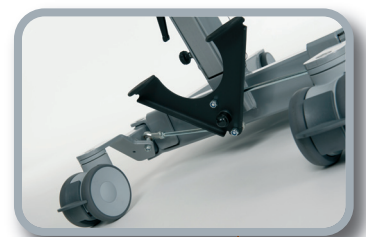
Caster with brake