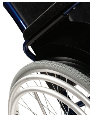
Hemiplegic (HEM2) version. Double rims to propel and to steer