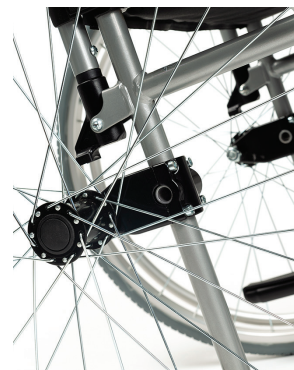
Amputee (AMP) version. Position of the rear wheel has shifted to the back