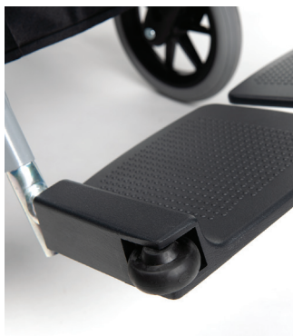
Aluminium footplates complete with rubber protection wheels