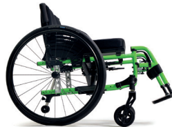
C85 Bright green