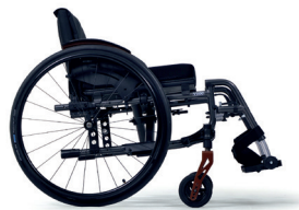
C86 Carbon grey

Unlock the opportunity to choose from a variety of hues, allowing you to personalize your wheelchair and truly embody your uniqueness.