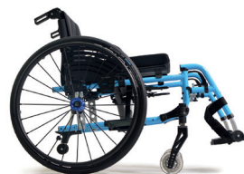
C79 Light blue