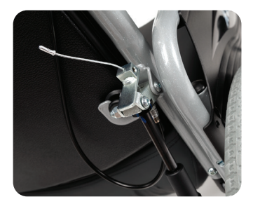
Adjustment of the backrest by means of gas spring for a smooth adjustement